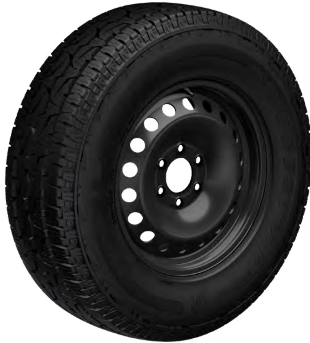
BRIDGESTONE ALL-TERRAIN TYRE