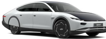
Dew Gloss Solid White 06