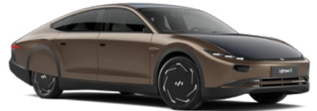
Soil Gloss Metallic Brown 04