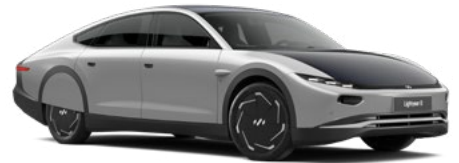
Stone Gloss Solid Grey 07