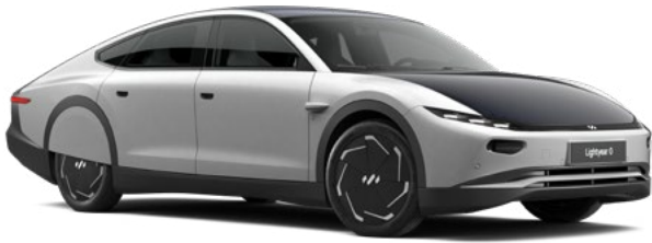
Zenith Gloss Metallic Silver 01

Lightyear 0 comes standard in Zenith Gloss Metallic Silver. Optionally, you can choose from a carefully curated selection of colours and finishes in wrapping.