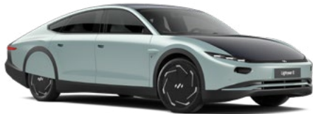
Mist Gloss Metallic Silver 02