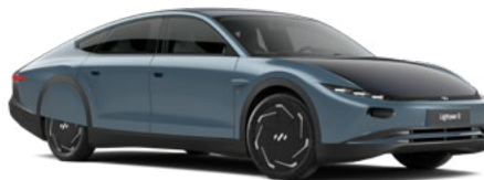
Dusk Gloss Metallic Blue 09