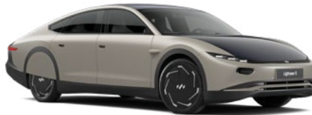
Sand Matt Metallic Grey 03