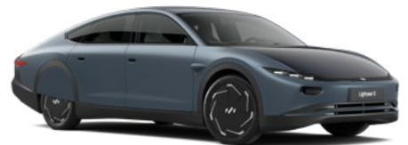
Aurora Satin Metallic Blue 10