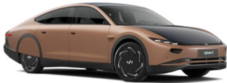
Clay Matt Metallic Copper 05