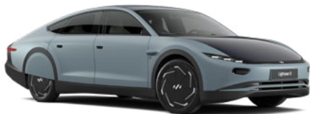
Dawn Satin Solid Grey 08