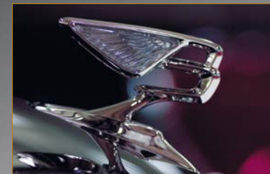
Bentley's famous flying B*